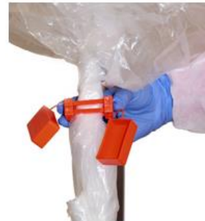
Trap Liner between prongs of 2nd Crimp & press together