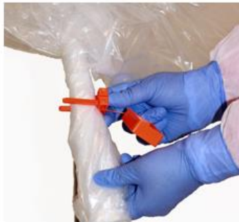
Twist Liner tightly & trap Liner between prongs of 1 Crimp