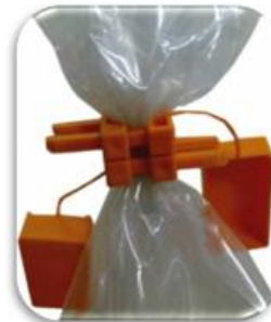
Engage Crimp Gun to Close Crimps