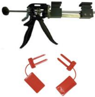
Select Crimping Gun & 2 Crimps

Recommend operators use Cut Resistant Gloves when using the HG Uni-Crimp System.