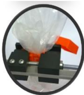
Fit Crimp Gun around Crimps