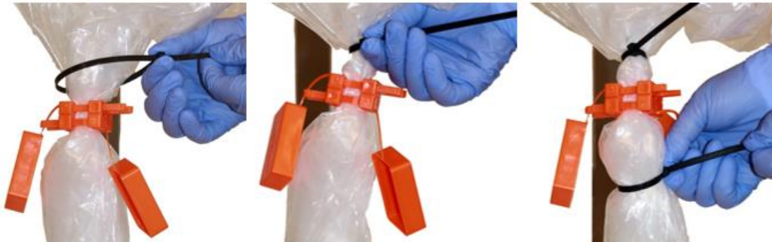
Tightly fasten Bag Ties Above & Below the Closed Crimps